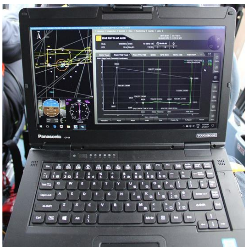
Laptop for operation of HeliFIS

The system is controlled by the approved Aerodata Flight Inspection Software, using the new Graphical User Interface layout on a ruggedized laptop computer. An additional Portable Cockpit Information Display (PCID) based on a tablet computer provides guidance information for procedure validation. Optionally, PAPI and Radar inspections can be performed as well.