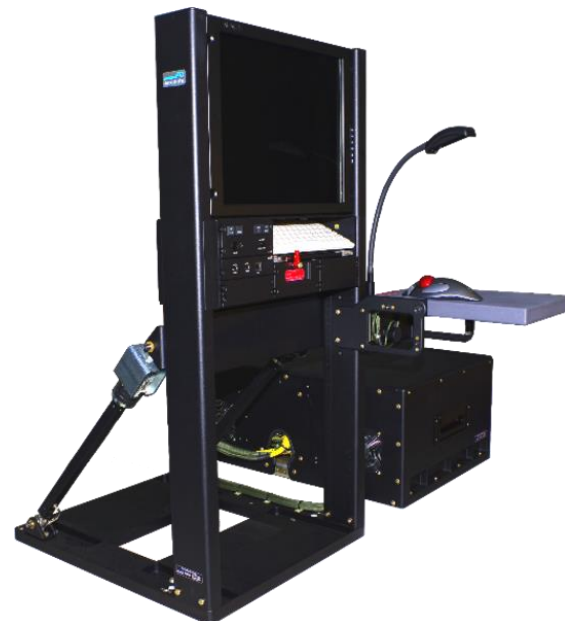
HeliFIS for Bell 429 Helicopter

The systems are built for flight checking/validation of procedures (GPS NPA, SID/STAR), RNAV (B-RNAV, P-RNAV, RNP) as well as NDB and PAPI.