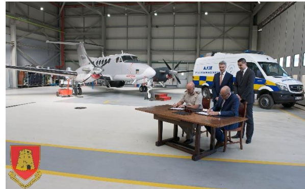
Inauguration Ceremony for the 3rd Maritime Patrol Aircraft of the Armed Forces of Malta

Following the inauguration ceremony on May 22 under the auspices of the Maltese Minister for Home Affairs and Security and the Parliamentary Secretary for EU Funds and 2017 Presidency, the aircraft was put into service by the Armed Forces of Malta.