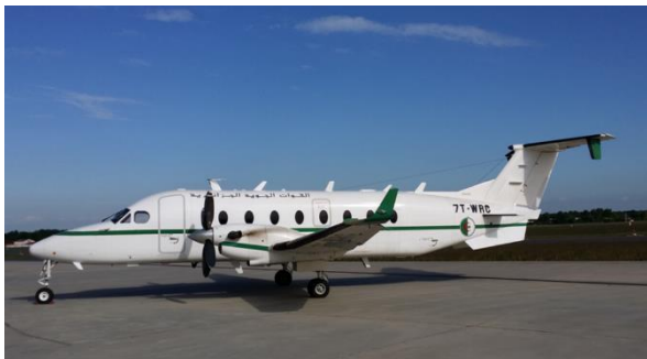
Algerian Air Force 1900D

In October 2016 a flight inspection system AeroFIS® delivered by Aerodata AG was put into operation by the Algerian Air Force. The AeroFIS® will be flexibly installed into two Beechcraft 1900D aircraft.