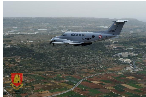
Arrival of 3rd Maritime Patrol Aircraft in Malta

At the end of April 2017, Aerodata has delivered the 3rd maritime patrol aircraft to the Armed Forces of Malta. The project was procured under the Internal Security Fund (specific Actions) Program 2014 – 2020 of the European Union. The first two aircraft had been delivered in 2011 and 2012.