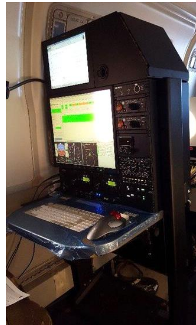
Algerian Air Force Flight Inspection System

The EASA certified autopilot coupling of the system substantially reduces pilot workload during flight inspection.